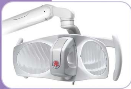
• LED-FARO- ALYA