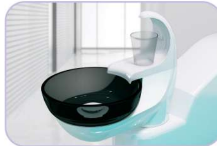
• New Cuspidor