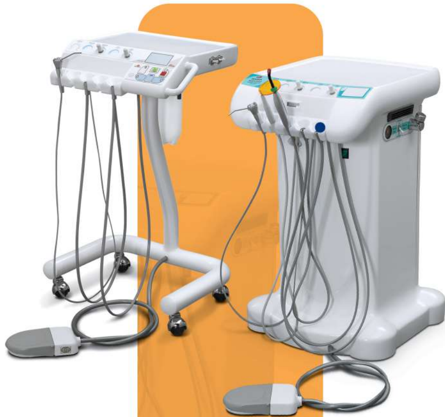
● MS 300 C Cart Version