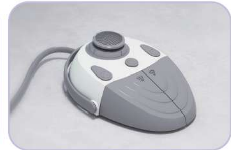
• Multi Function Pedal