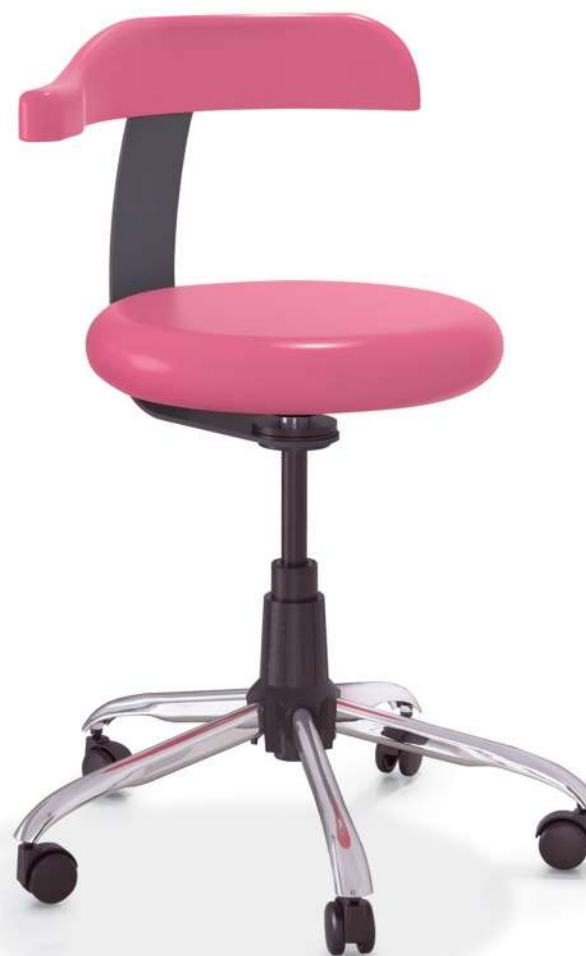
● Lotus Stool