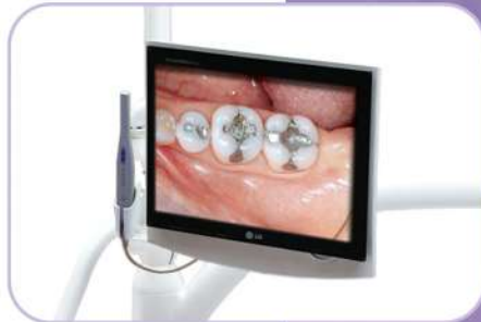
• LCD Monitor & intra oral camera