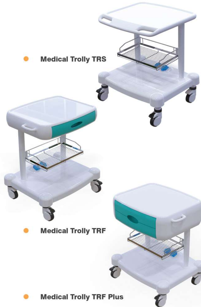
● Medical Trolley TRS