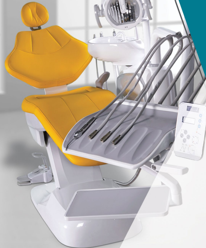
LUXURY Patient Chair With safety system